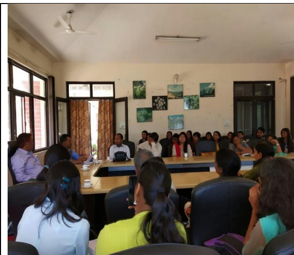
Herbal Research and Development Institute (HRDI), Mandal, Gopeshwar

On the next day students Visited Herbal Research and Development Institute (HRDI), nodal agency of Uttarakhand Medicinal Plant Board, has been established for conservation, development and sustainable utilization of the valuable Medicinal and Aromatic Plant resources of Uttarakhand in Mandal-Gopeshwar, Uttarakhand.