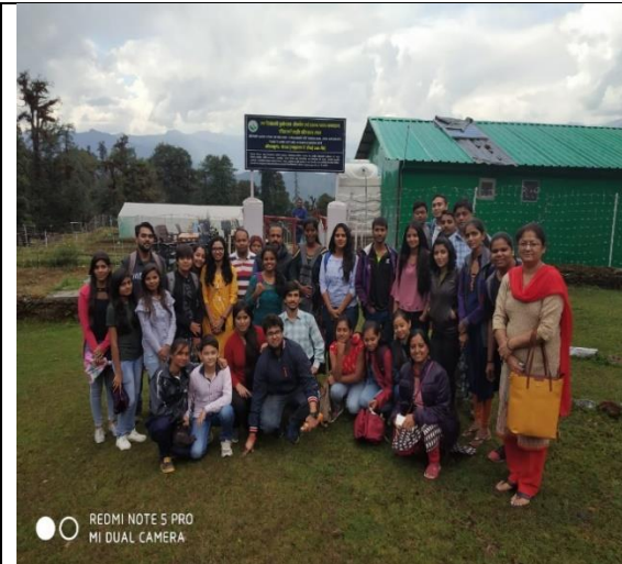
High Altitude research station, HAPPRC, Chopta.